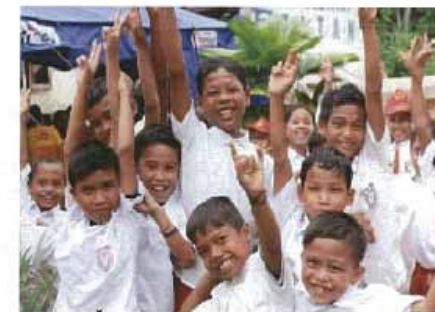
Children overcame the misery by the earthquake in Indonesia and their smile is back.

(PARCIC) PARC Interpeoples' Cooperation (PB) Peacebuilders (PEN) Peace NGOs Hiroshima (PLAN) Plan Japan (PWJ) Peace Winds Japan (SCJ) Save the Children Japan (SEEDS) SEEDS Asia (SNS) Sar Nevesht Saz (SVA) Shanti Volunteer Association (WVJ) World Vision Japan