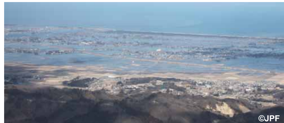
Towns devastated by tsunami