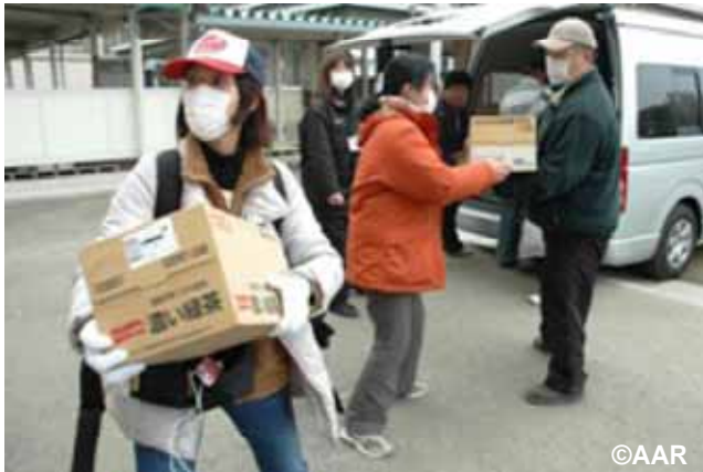
Food distributions in cooperation with local PTA to 500 people at Sendai Municipal Nakano Jr. High School (Drinking water, tea, oranges, bananas, snacks)