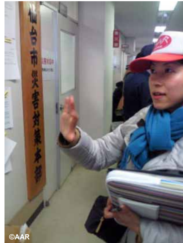
Investigating the degree of disaster and relief situations at the Sendai City disaster control headquarters