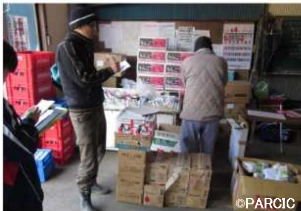
▲ Goods checked and submitted to victims