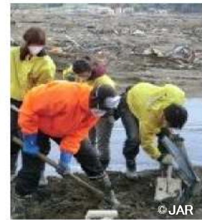
▲ Refugees managing volunteer teams