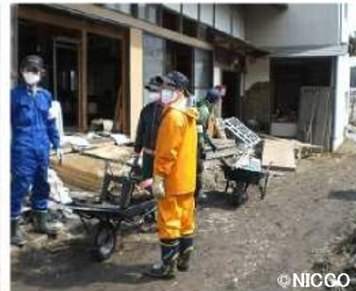
(Left, middle) Staff and student volunteers cleaning up a schoolyard