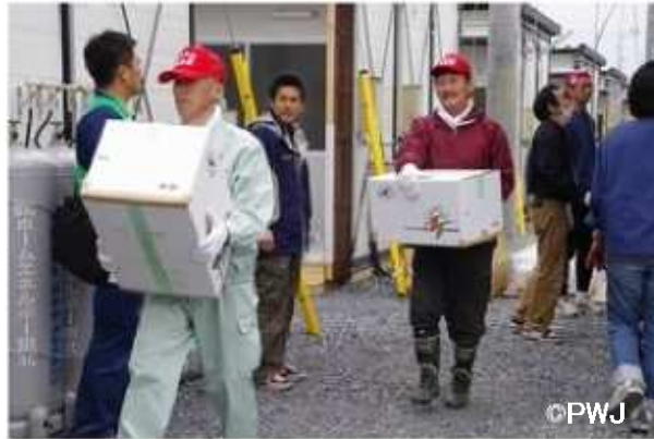
▲ Staff and volunteers carrying items