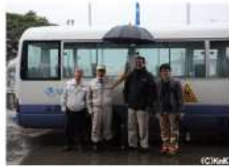
▲ Bus offer ceremony

A school bus arrived at Yamada on 23 April, in time for the opening ceremony on the 25 th . We prepared 6 buses for children living in evacuation centers. Moreover, we conducted educational support such as distributing school uniforms, maintenance of staff rooms and so on.