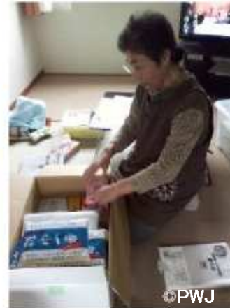
▲ We deliver items suitable for each family.

We sent daily commodities to 188 people (71 families) who started living in temporary houses in Chinomori, Ofunato, Iwate Prefecture. The goods are collected in cooperation with AEON Co.,Ltd. and selected according to the victims' gender and number of people in each family.