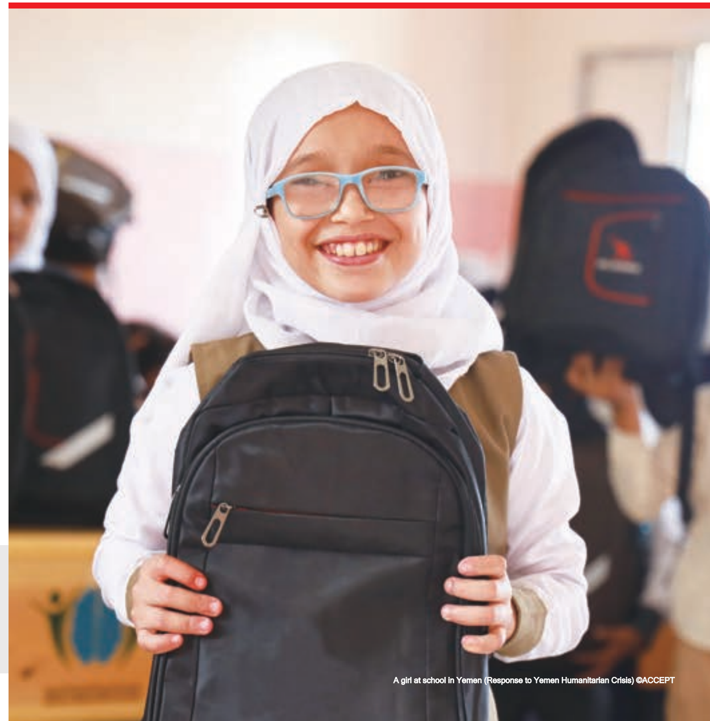
A girl at school in Yemen (Response to Yemen Humanitarian Crisis)