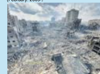
Gaza Strip on October 10, 2023