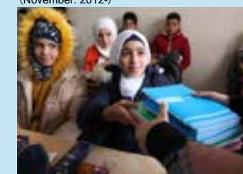
Students receiving distributed textbooks and stationery