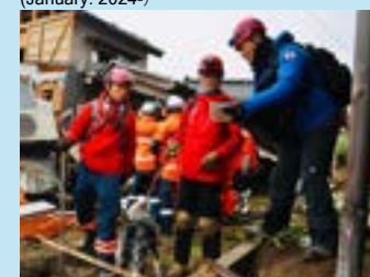
Search and rescue activities with disaster rescue dogs