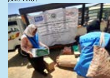
Food distribution at a shelter school in the province of Kassala