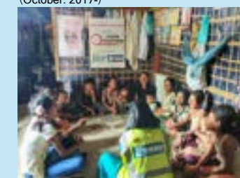
Children participating in hygiene training with health support volunteers