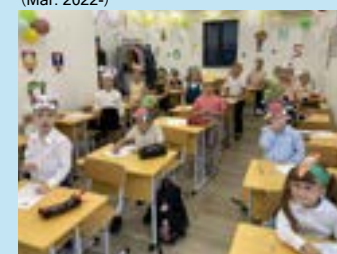
Learning space for children operated by PLAN