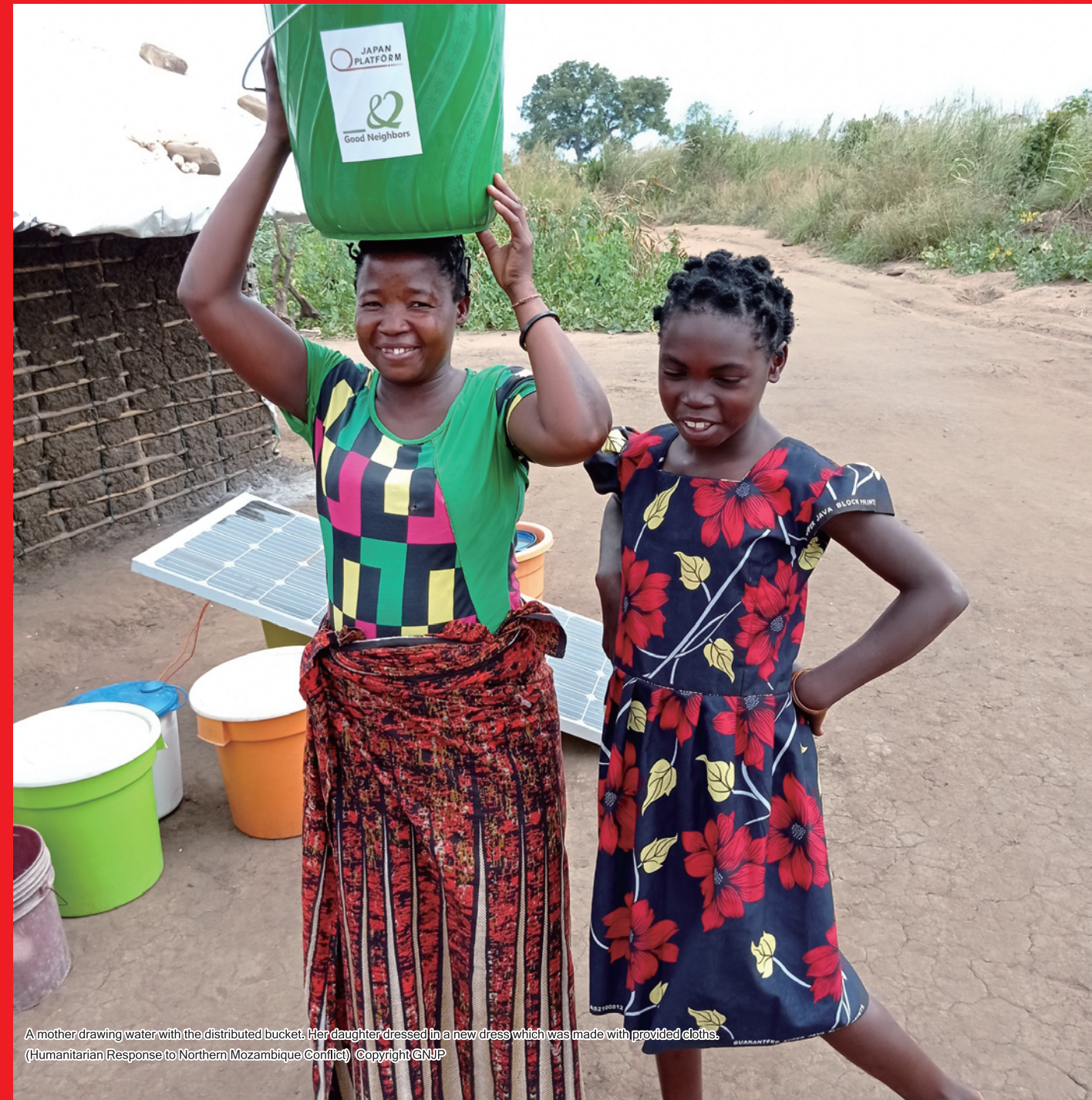
A mother drawing water with the distributed bucket. Her daughter, dressed in a new dress which was made with provided cloths. (Humanitarian Response to Northern Mozambique Conflict)