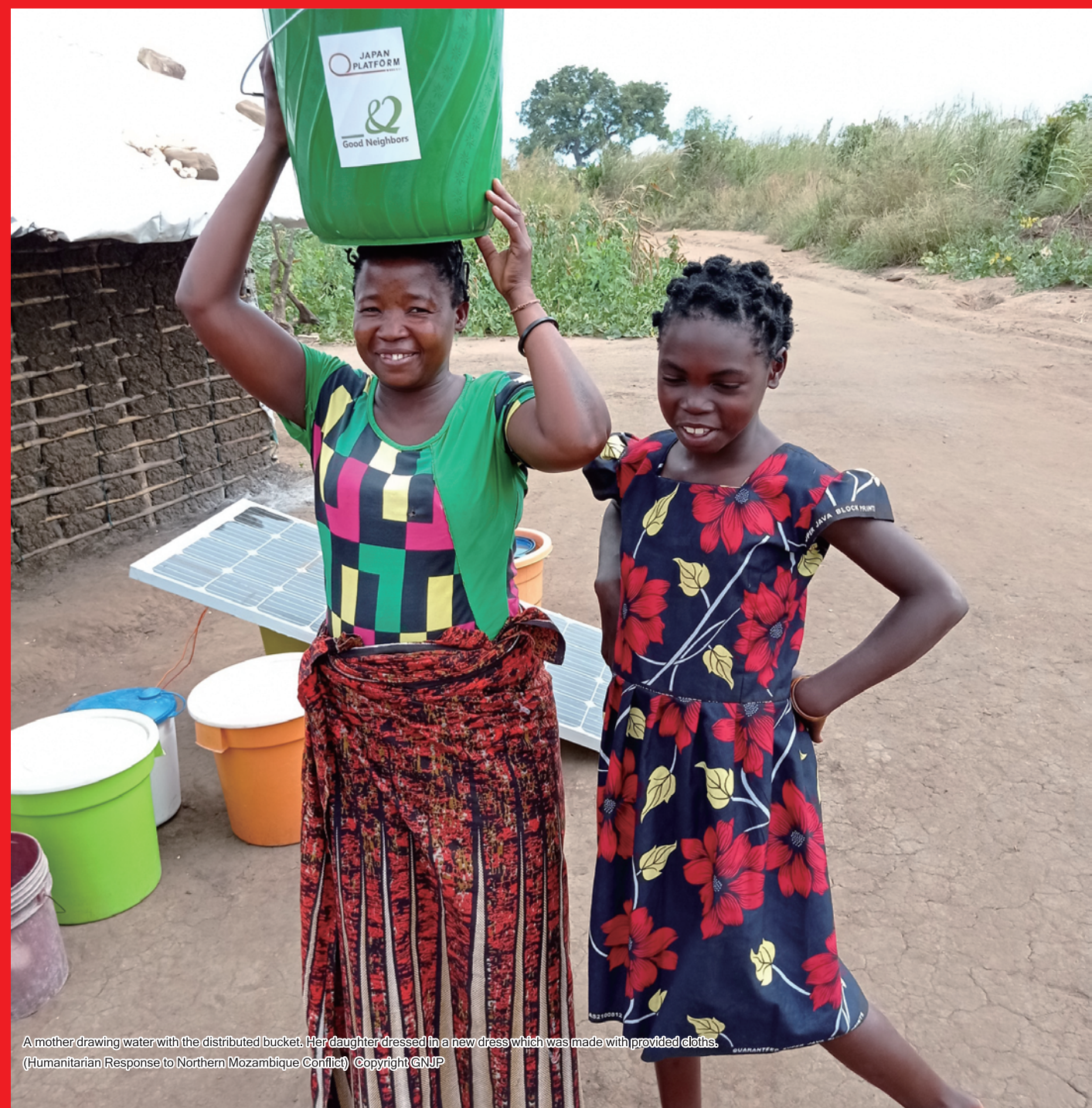
A mother drawing water with the distributed bucket. Her daughter, dressed in a new dress which was made with provided cloths. (Humanitarian Response to Northern Mozambique Conflict)